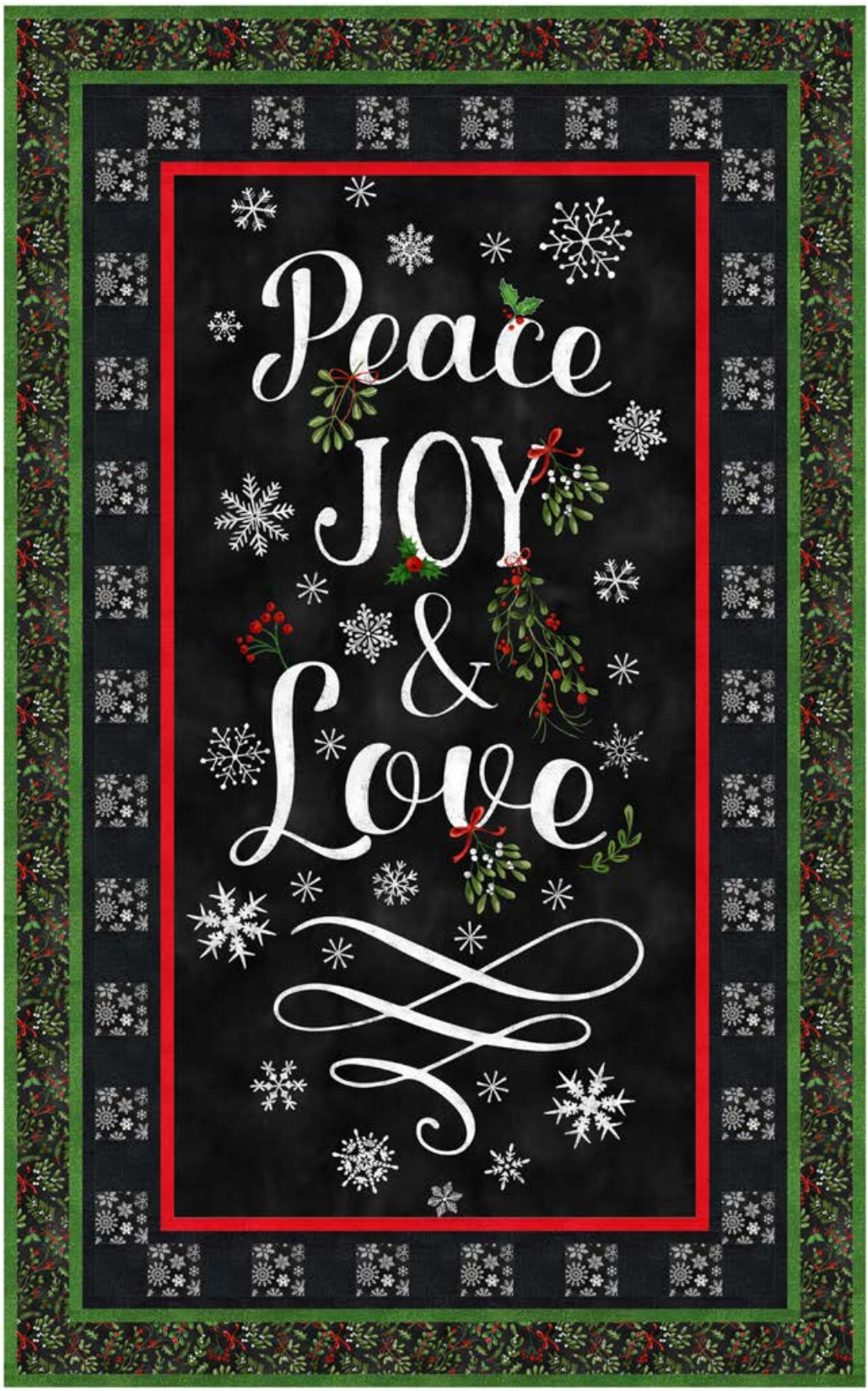
Finished quilt size: 32½" x 52½"